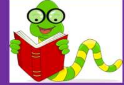
"A book is a gift you can open again and again."