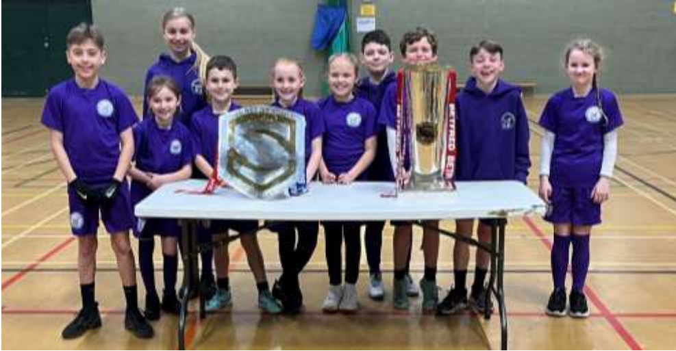
Children posing with Wigan Warriors trophies.

The team played 3 games and won them all. Super proud as always!